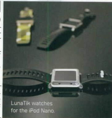
LunaTik watches for the iPod Nano.

DREAM PROJECT An electric utility vehicle.