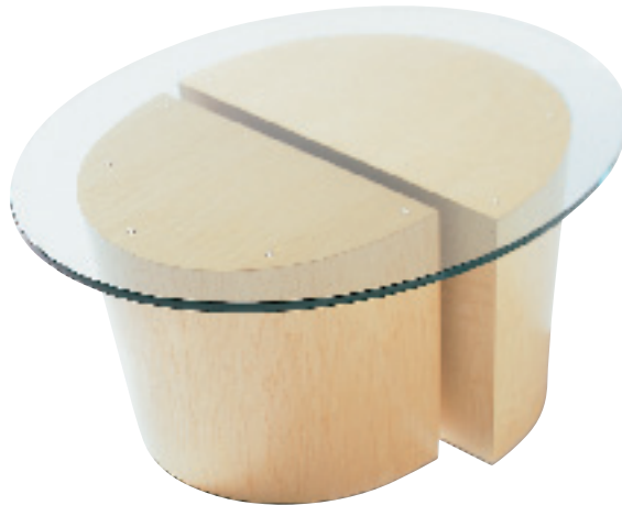
47-T17ELG Wood Tables with Glass