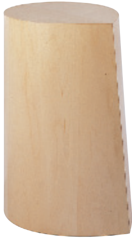
47-T23EL Wood Table