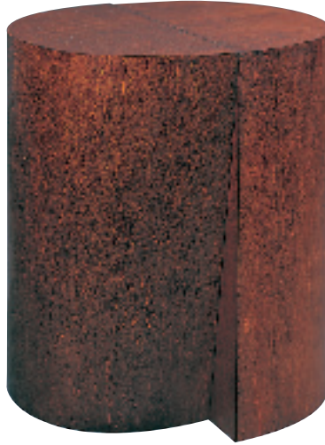
47-T1623B (left) and 47-T1623A (right) Wood Tables