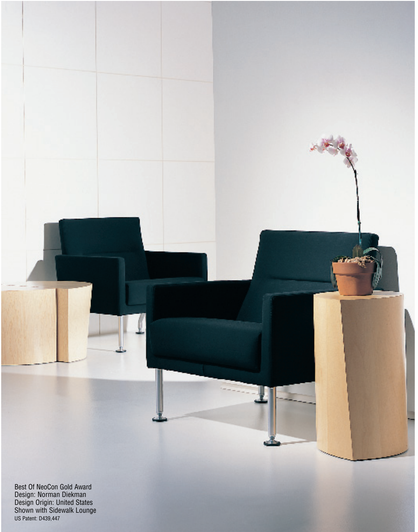
Best Of NeoCon Gold Award Design: Norman Diekman Design Origin: United States Shown with Sidewalk Lounge US Patent: D439,447