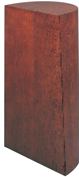
47-T1326C Wood Table