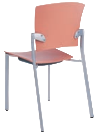
3503S Armless Chair/Polypropylene Seat and Back