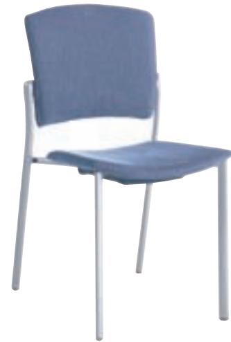
3501S Armless Chair Upholstered Seat and Back