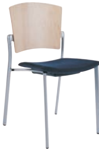
3502S Armless Chair Upholstered Seat and Wood Back