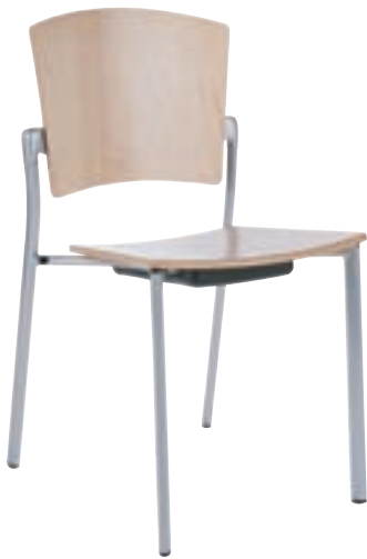
3500S Armless Chair Wood Seat and Back