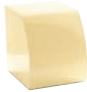
70-E-PTM Curve Low, Yellow Hand Polished / High Gloss Paint