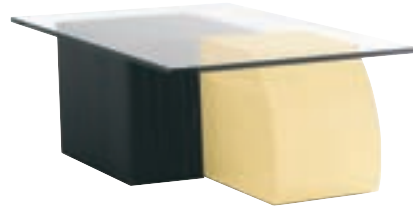
70-EFG-1 Curve Low / Yellow Hand Polished / High Gloss Paint Cube Low / Black Embossed Wood

Surface Materials: Substrates on metal coated and high gloss painted tables are composed of 100% pre-consumer recycled wood fiber. Metal-coated tables are clear-coated to resist oxidation. Embossed wood tables have smooth top surface. SensiTile® is a terrazzo material with fiber optic light pipes. Hand polished high gloss paint is pigmented, two component polyurethane. Height adjustable glides standard.