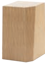
70-C-TPM Bevel High, Embossed Wood / Natural Finish