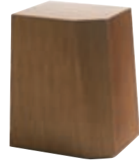
70-D-TPM Bevel Medium, Embossed Wood / Medium Brown