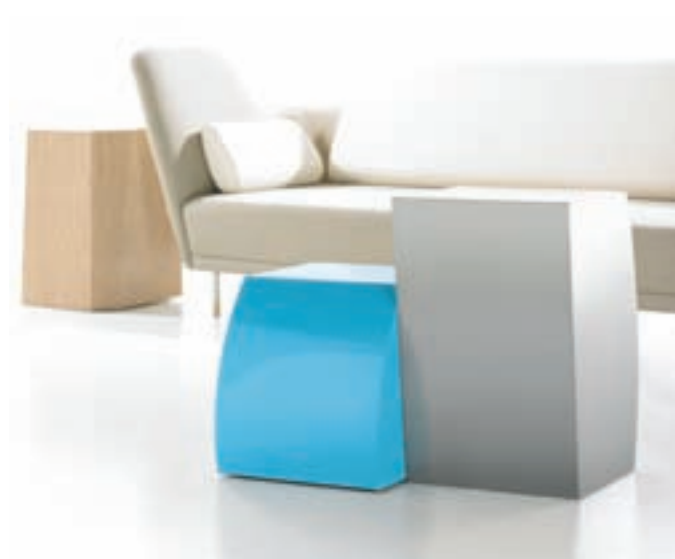
a. 70-F-TPM - Cube Low / Black Embossed Wood b. 70-D-TPM - Bevel Medium / Medium Brown Embossed Wood