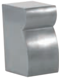
70-B-SMM Fold High, Aluminum Spray Metallic