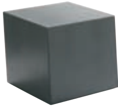
70-F-LPT Cube Low, SensiTile / Black