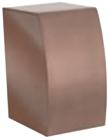
70-A-SMM Curve High, Copper Spray Metallic