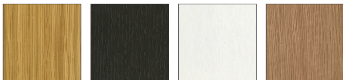
Oak Light VP01