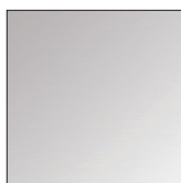
Polished Trivalent Chrome 9201