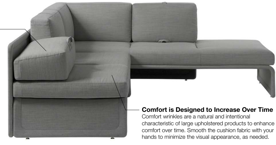
Lagunitas 3-Seat Chaise and 2-Seat Lounge

Articulating Back Cushion with Handles Shifting between focused and informal work modes is as simple as lifting a handle, built into every articulating back cushion.