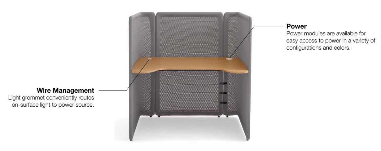
Lagunitas Focus Nook

Lagunitas Enclosed Booth with Booth Connector Screen, 26"H Work Table and PowerPod