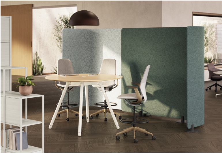
Freestanding screens with removable, zippered sleeves allow for easy assembly and disassembly — enabling future reconfigurability and reuse.