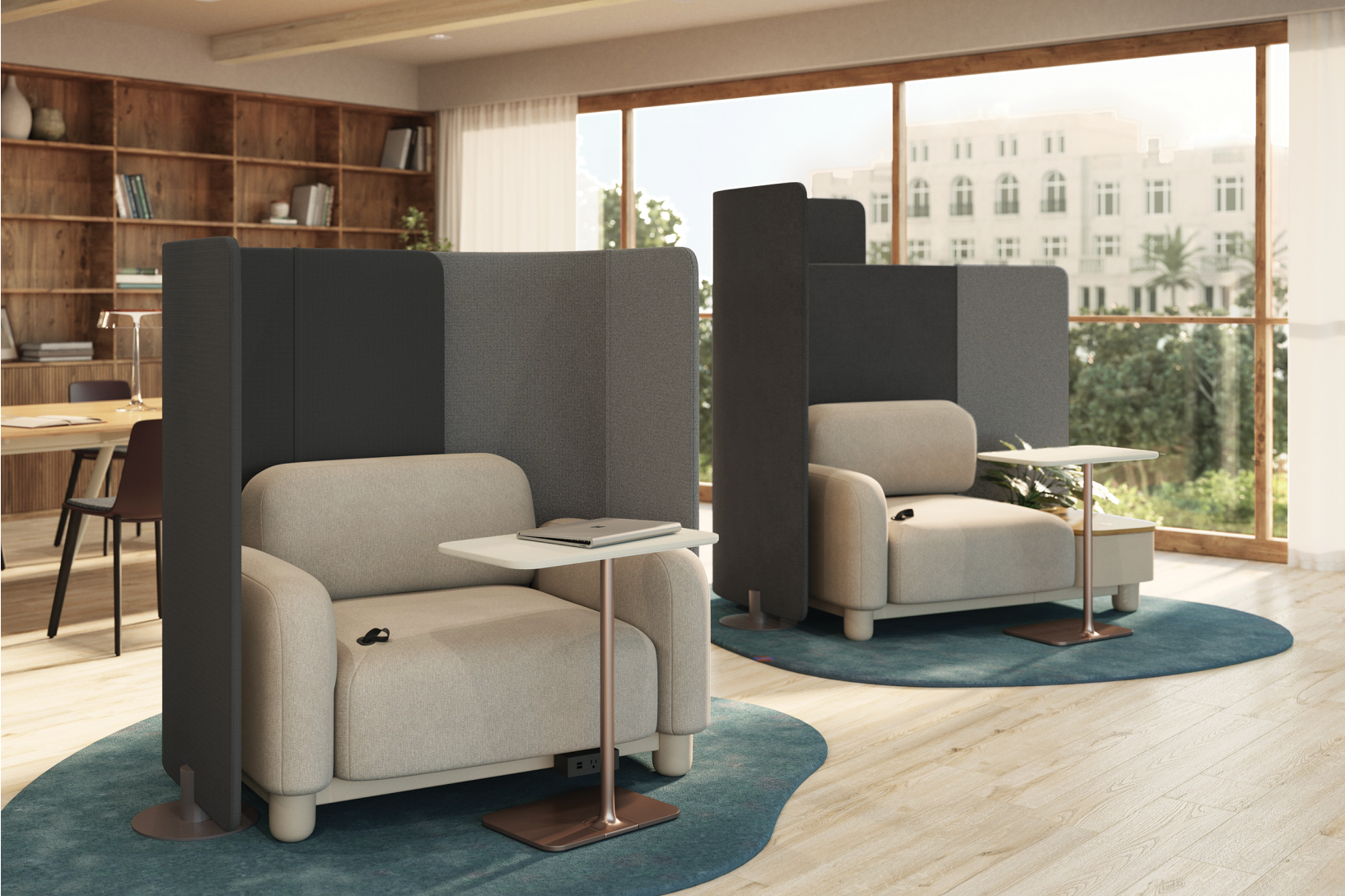
Universal building blocks can be assembled in countless ways and complement many other furniture styles.