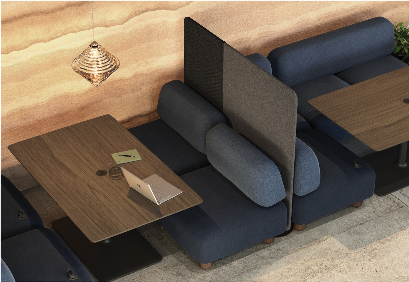
Ensemble applications pair with Coalesse Lagunitas 26" high Work Tables and Lagunitas Personal Tables.

Gathering your way. Universal modularity lets all the pieces fit together. Seat, table and planter modules on an easy-to-scale rail system along with companion screens allow for flexible configurations that can grow and change frictionlessly over time. Choose the pieces that fit your needs.