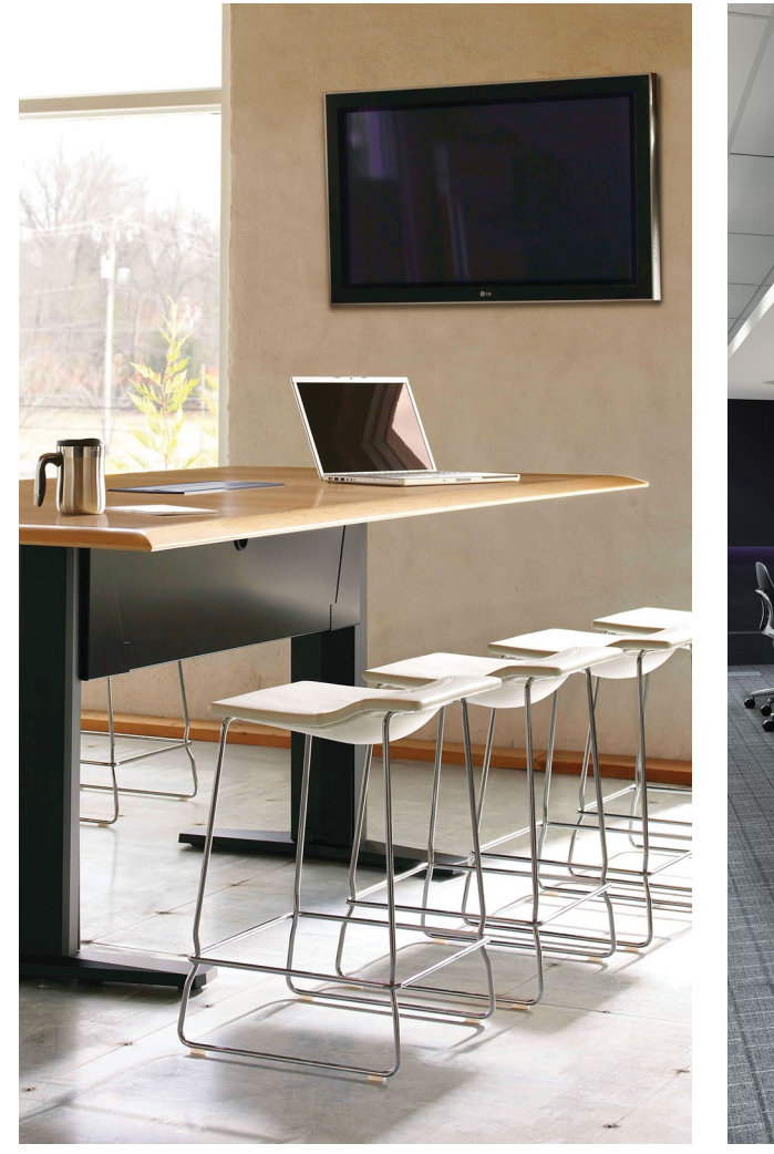
E-Table (standing height)