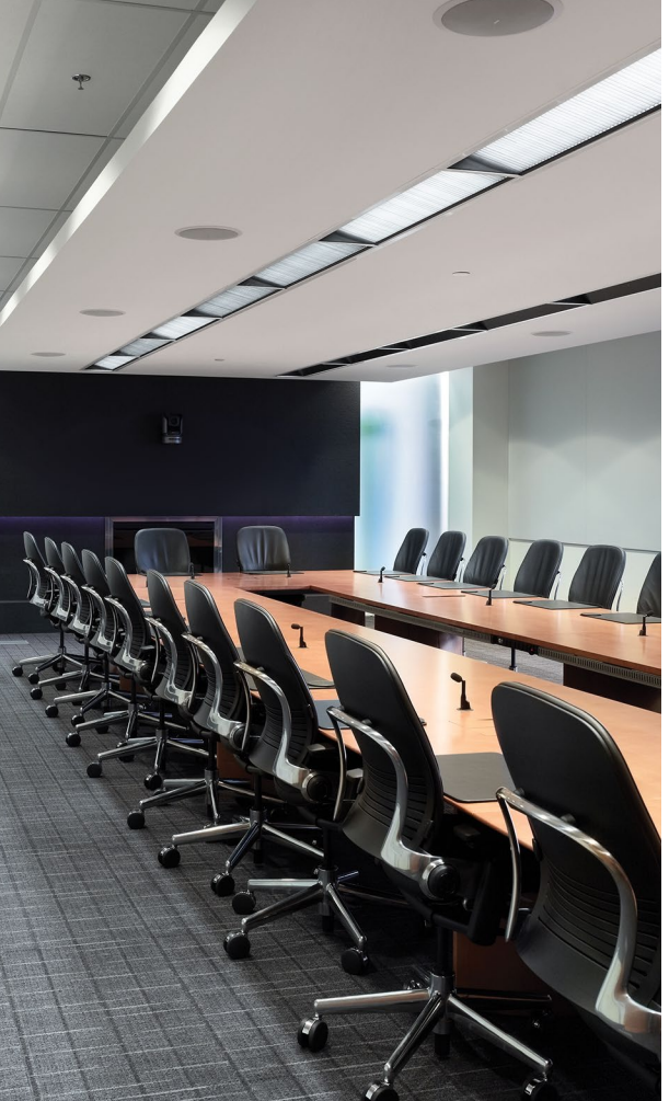
Host Table (custom size and cutouts)